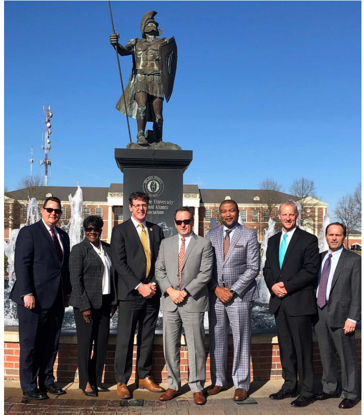
Members of the Alabama State Board of Public Accountancy attend the board meeting at Troy University.