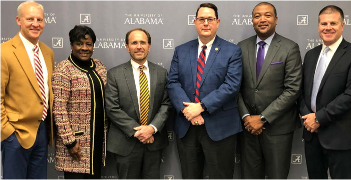
Members of the Alabama State Board of Public Accountancy attend the board meeting at the University of Alabama.